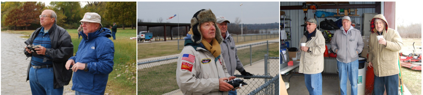
Remember when we needed these? Feeling Cooler Yet?