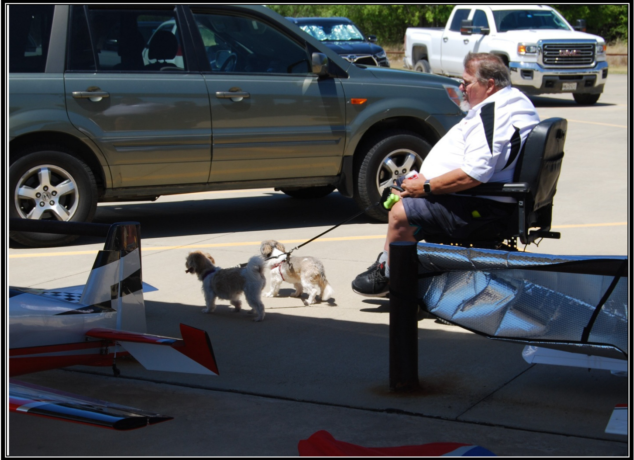
'Getta Long 'Lil Doggies'